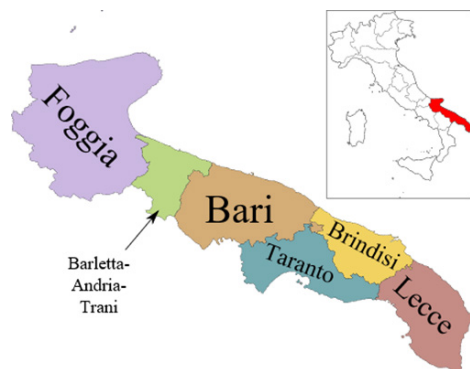
Figure 1 Apulia, South-Eastern Italy, 4 million inhabitants.

cost of a new drug, it is often impossible to appreciate the whole possible positive impact following the introduction of a new treatment; that is the case of direct anticoagulants in the prevention of thromboembolic complications of atrial fibrillation. 16 When, instead, also individual, municipality and social costs are duly weighted, apparent increased costs may turn into considerable savings.