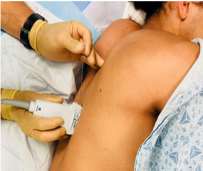
Image 1. In preparation for administration of erector spinae plane block, the patient is positioned in either lateral decubitus with the affected side up or prone with the provider at the head of the bed. The needle trajectory is from cranial to caudal.

After the patient gave verbal consent he was placed on a cardiac monitor and rolled into the left lateral decubitus position. The physician stood at head of the bed facing the patient's feet with the ultrasound monitor in direct line of sight (Image 1). The first lumbar (L1) spinous process was identified using surface landmarks and ultrasound imaging and the skin cleansed with chlorhexidine. A high-frequency 10-5 megahertz linear ultrasound probe was placed in the parasagittal plane approximately three centimeters (cm) lateral to the spinous process at the right L1 transverse process. Under ultrasound-guidance, a 20 gram (g)-3.5 inch Touhy needle was advanced in-plane, cranial to caudal, until