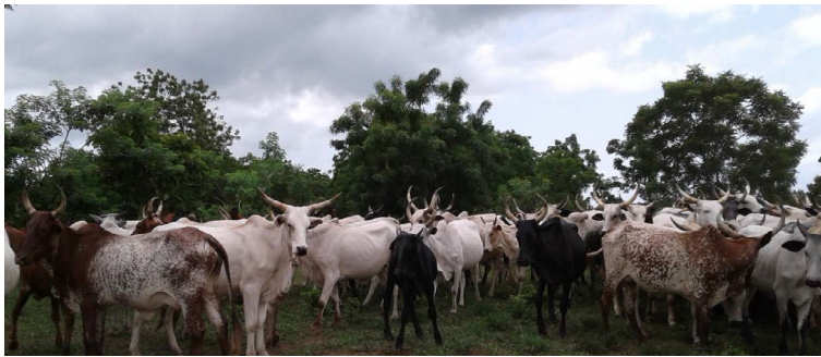
Fig. 2 Crosses of breeds between Gudali and Zebu on a cattle farm in the North Tongu district.

goats. Out of the 20 farms sampled, 13 (65%) were mixed-flock, 5 (25%) cattle-only and 2 (10%) goats-only. Flock sizes for the various species are displayed in Table 1.