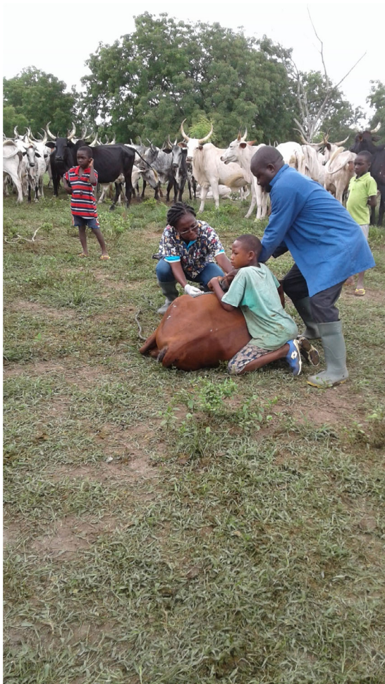
Fig. 5 Children assist in the herding of cattle for grazing and other interventions on a farm in North Tongu.

The only two published reports on Q fever in Burkina Faso were all in human populations (Gidel & Athawet 1975; Ki-Zerbo et al. 2000). Ki-Zerbo et al. (2000) reported Coxiella burnetii in 13% of febrile and hospitalized patients in Burkina Faso and the high incidence was found among 30–60-year-olds. However, a search through literature did not yield any livestock prevalence in Burkina Faso. Nonetheless, given that reservoir of Q fever infection is primarily in livestock, it is highly probable that the infection exists in livestock. With free movement of livestock between all three neighbouring countries, the organism C. burnetii could be shared freely among these countries.