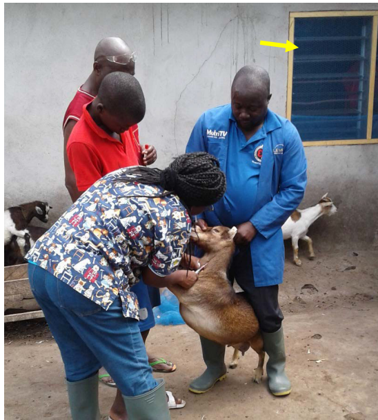
Fig. 3 Sheep and goat pen sited next to the window of a bedroom (arrowed yellow) of a farm family.

sampled. Fig. 4 shows an ELISA plate from results of seropositive and negative in the tested animals.