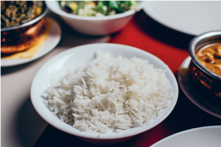
Photo: Rice is the main dish in South Asia. The image is downloaded from unsplash.com, originally contributed by Pille-Riin Priske, @pillepriske.

and middle income countries where traditional medicine serves the community in the fore front, in South Asia, ancient Ayurvedic medicine and other folk healing practices are attended by huge proportion of population. These practices, although, adequately not proven to have effect in Diabetes, continue to attract people with chronic illnesses including Diabetes and may exacerbate the disease progression by delaying the health seeking behaviour.