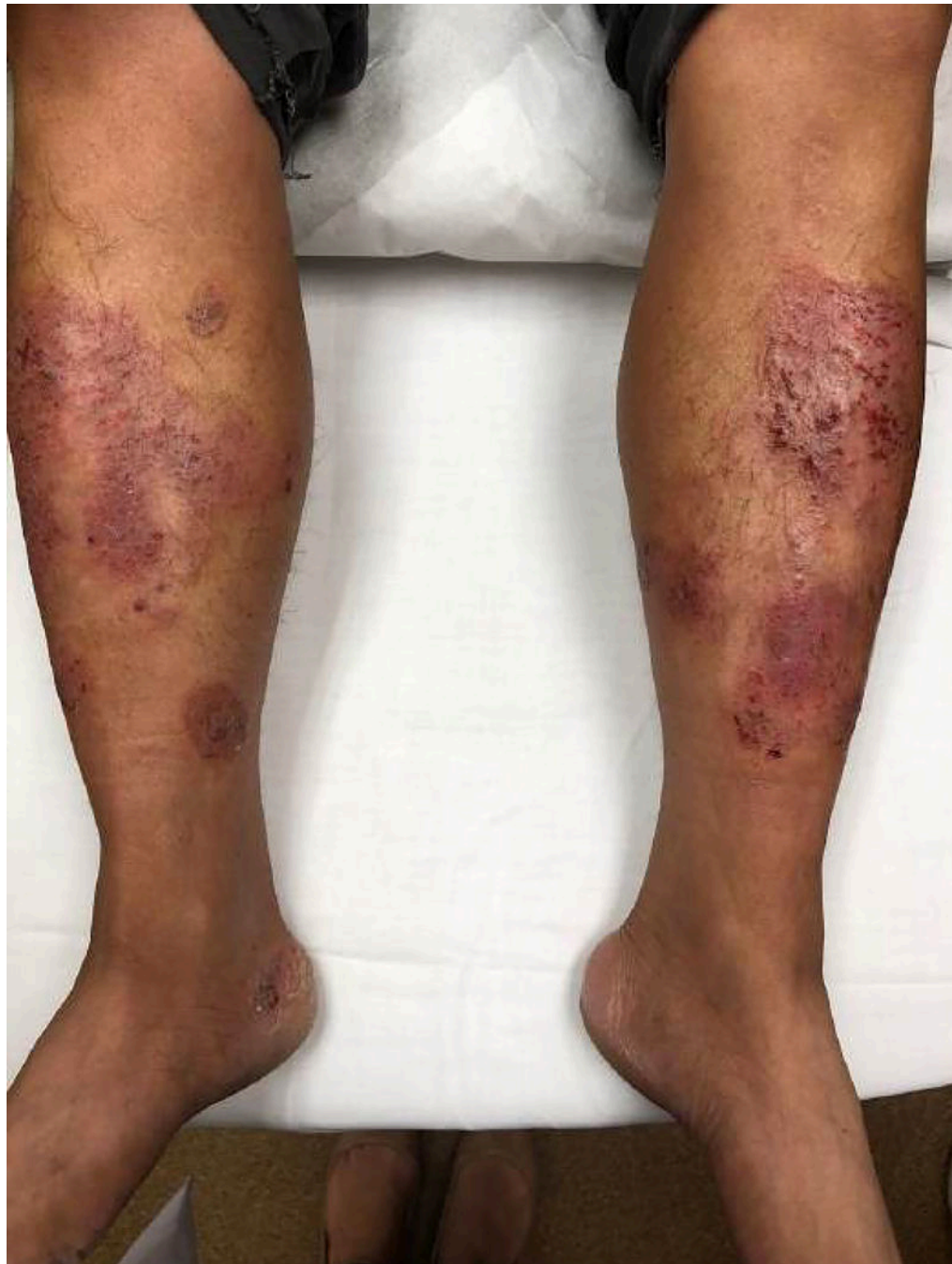
Figure 1: Bilateral well-demarcated oval well-demarcated erythematous asteatotic plaques on bilateral shins.