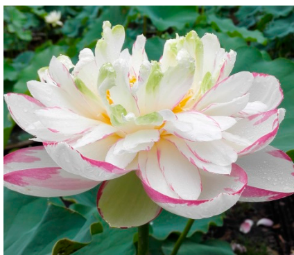
Figure 3. Lotus cultivar with spotted color flower.