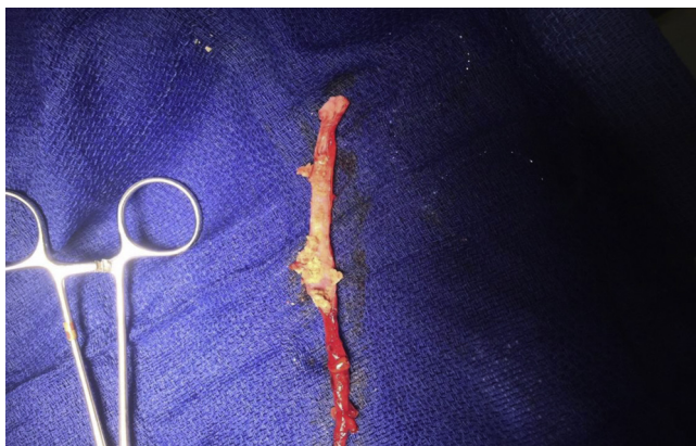
Fig 1. Excised great saphenous vein (GSV) with intraluminal foreign body.

and is not consistent with what we see in our practice, suggesting the need to more clearly define this condition and to track its incidence in future studies.