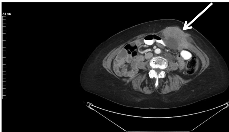
Fig. 1. CT cut through the left mid-abdominal laparoscopy port site metastases. The entire thickness of the left rectus muscle appears to be infiltrated by serous ovarian cancer. The skin and subcutaneous tissue beneath the skin are not involved. The bowel directly beneath the mass does not appear to be invaded.

disease. Disease was confined to the pelvis. Postoperatively, modified FIGO stage was IC3 because of ovarian capsule rupture prior to surgery and positive peritoneal cytology. Postoperatively, she received intravenous paclitaxel and carboplatin for 6 cycles.