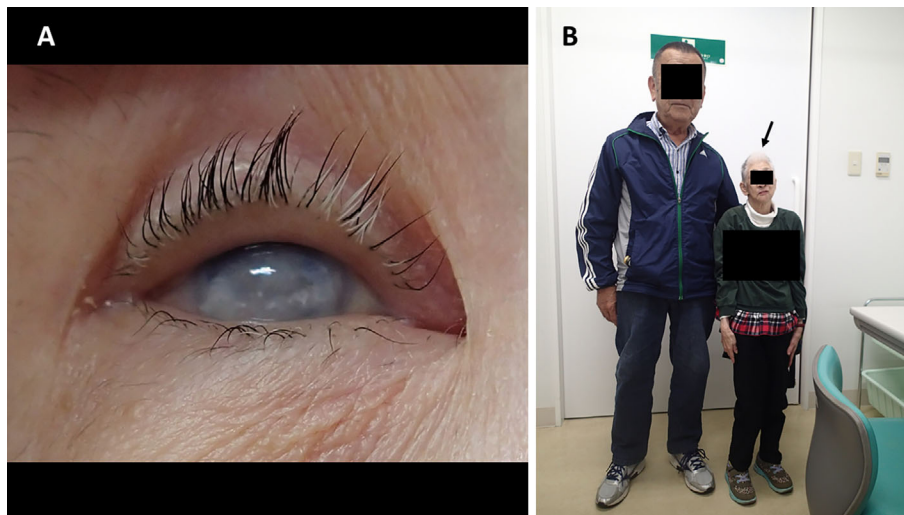
Figure 1. Physical features of the patient. Right eye and whole-body images show the presence of a cataract (A), dwarfism and microcephaly (B, arrow).