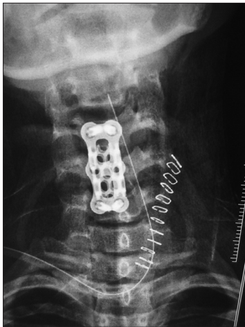
Figure 2: Immediate postoperative anteroposterior view after corpectomy C5 vertebra

The most common level of vertebral fracture was C5 in 21 (21.2%) followed by C6 in 14 (14.1%). Of the 99 procedures, 77 (77.8%) involved a single vertebral level, 19 (19.2%) involved two levels, 3 (3%) involved three levels corpectomy, and most common vertebra to be corpectomized was C5 in 28 (28.3%) followed by C6 in 22 (22.2%). The incidence of neurological deficit was more in patients in which two or three vertebra corpectomy was done (20 out of 22, i.e., 90.90%) compared with patients, in