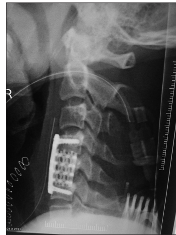
Figure 3: Immediate postoperative lateral view after corpectomy C5 vertebra