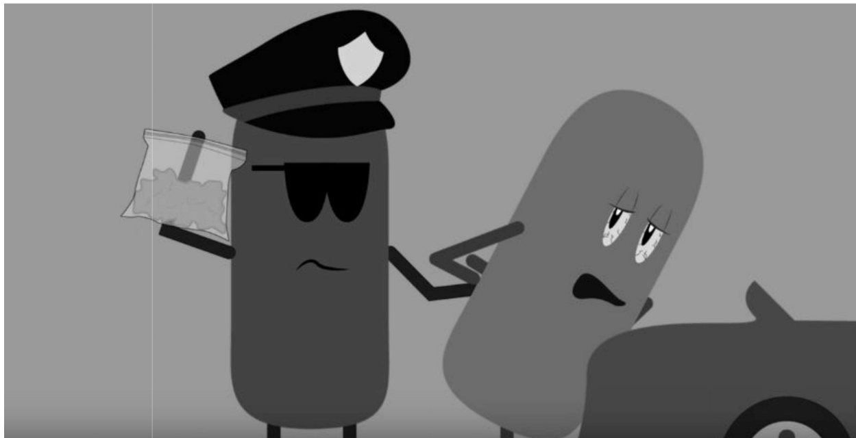
Fig 1. S4E youth prevention intervention content.

https://doi.org/10.1371/journal.pone.0221508.g001