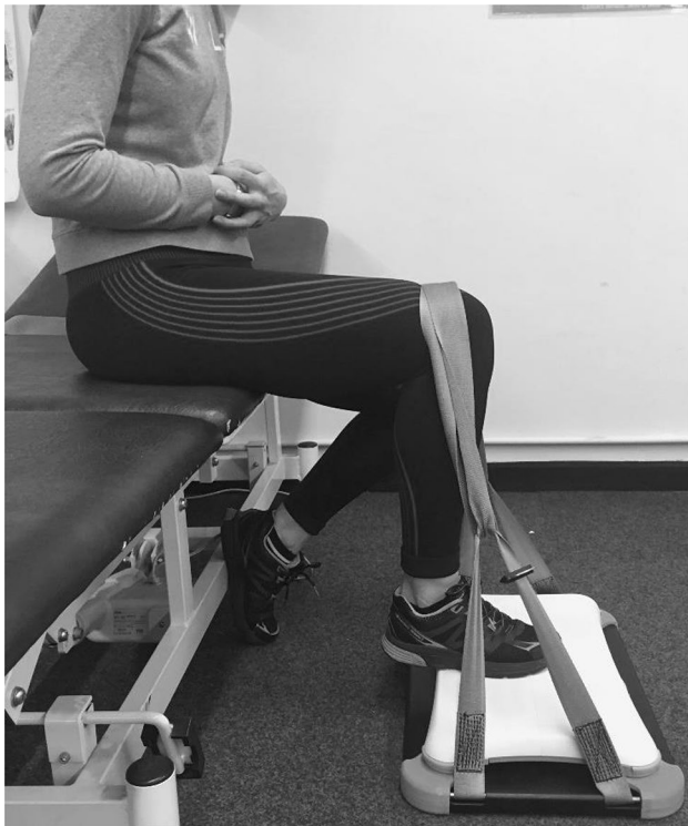
Fig. 2 The Fysiometer setup with the subject seated on a physiotherapy couch, the hip and knee at 90° flexion and the ankle joint in 10° of plantar flexion. The Wii platform was positioned flat on the floor and a belt with a tensioner device was used to fix the ankle in position for the isometric contraction

software utilises a sampling rate of 100hz which is filtered through a fourth-order Butterworth filter, the software has an accuracy of 0.1 kg on the whole measurement range from 0 to 300 kg. The test–re-test ICC is 0.79, based on a study of 20 subjects completed at the university. Isometric force data were only used as a method to determine the intervention threshold. Mean (SD) isometric force output during the pre-intervention was 101.9 kg ( \pm 23.6 ), this equated to 127.7 ( \pm 29.4 ) percent of body weight (%BW). Isometric data were not measured post-intervention as it has not previously been shown to be relevant. The Fysiometer has previously been identified as a valid and reliable tool for quantifying maximal isometric plantar flexor muscle strength [19]. Each subject was carefully positioned with their heel over the nearside edge of the Wii platform and their metatarsals on the inside edge of the unit (Fig. 2). All subjects were seated on a plinth with the ankle positioned at 10° of plantar flexion and the knee and hip at 90° flexion, a goniometer was used to verify these positions. The flexed knee position was utilised for the isometric intervention in this study as our previous work has identified that the Soleus muscle may be more involved in the motor deficits associated with Achilles tendinopathy and the area of the Achilles most commonly affected by tendinopathy appears to relate to fascicles linked