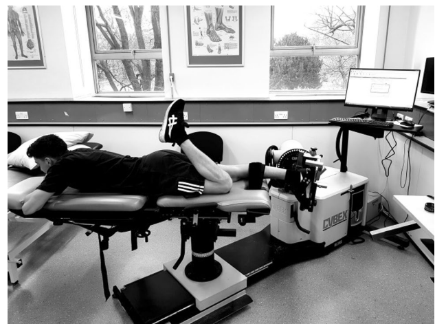
Fig. 1 The position used for isokinetic dynamometry testing. The test leg was fully extended. The non-tested leg (left) was only flexed in this image to allow visualisation of the leg being tested

The intervention was based on previous work by Rio et al. [40, 41] and recommendations for Achilles tendinopathy [10]. The intervention utilised five 45-s isometric plantar flexor contractions at 70% MVC—separated by 2-min rests in accordance with the protocol used for patellar tendinopathy [10, 40, 41]. To determine subject’s 70% MVC all subjects had their MVC (isometric) measured using a Fysiometer (Fysiometer ApS, Denmark) [19]. The Fysiometer