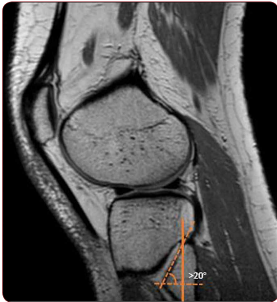
FIGURE 1. Classification of PTFJ. The inclination angle is defined as the angle between PTFJ and the perpendicular line of the fibula axis. This sagittal PD image shows an oblique-type PTFJ.

prevalence of osteoarthritis after the fifth decade (24), those with comorbidities such as rheumatoid arthritis, osteoarthritis or any obvious bony and ligamentous abnormalities, and who had a history of knee joint surgery were excluded from this study. According to the mentioned criteria, 69 patients (38 females and 31 males) were selected for analysis. A group of aged-matched control patients without DLM were also included in this study (48 females and 21 males). As in the recently published study (23), sagittal images were used to assess the PTFJ inclination angle and classification based on the accepted Ogden method (16) (Figure 1).