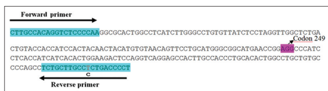
Figure 1: Junction of the primers in exon 7, codon 249