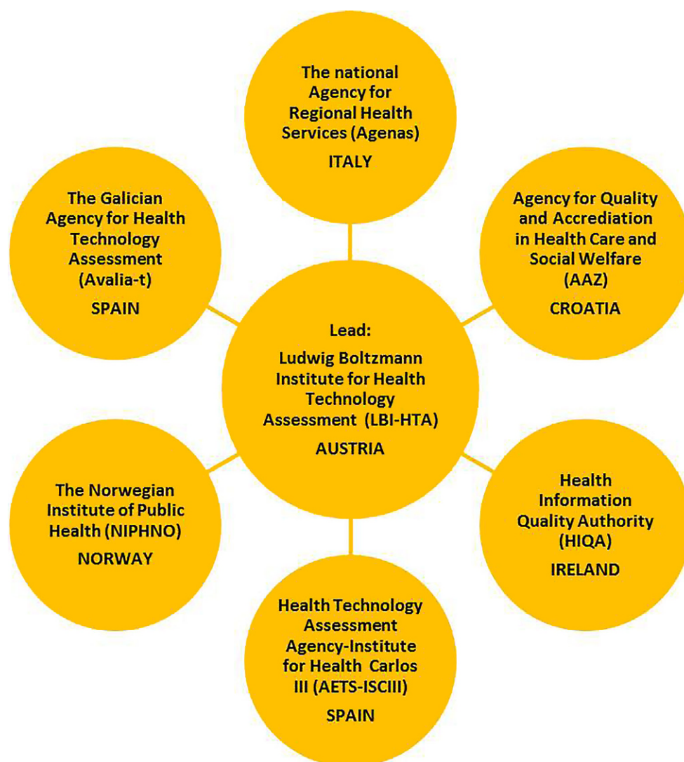
Fig. 3 Activity Centres for managing collaborative assessments of “other technologies”