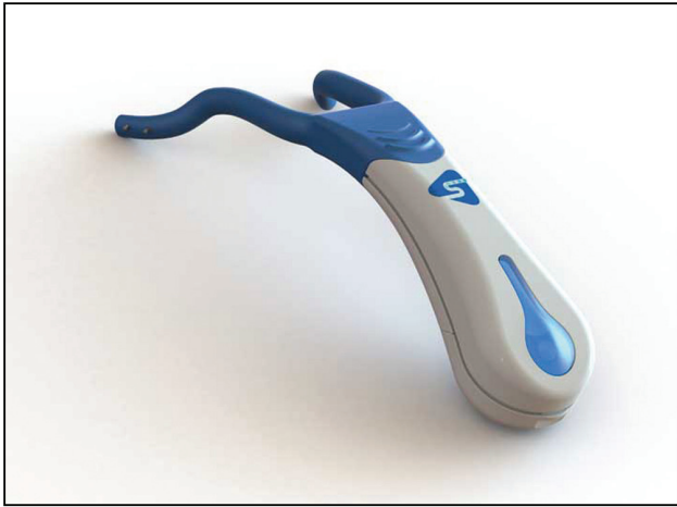
Figure 3: SaliPen