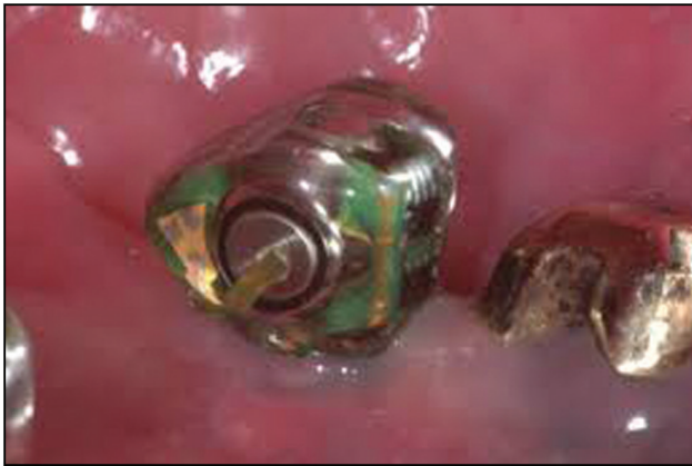
Figure 4: Saliwell Crown

permanent salivary stimuli in extreme cases [Figure 4]. Use of this fixed device avoids any inconvenience associated with using mobile devices. The components of the removable device are miniaturized into small modules and packaged into devices of the size and shape of molar teeth. This is adjusted to standard osseointegrated dental implants. It also includes a sensor to identify any alteration in intraoral dryness. Saliwell Crown produces continuous stimulation in the mouth without affecting normal function. Any increase or decrease in stimulation is automatically adjusted according to the status of dry mouth and even it can be managed by patients with an on and off button. An osseointegrated implant is positioned distal to second molar area close to lingual nerve, which stimulates salivary gland. At present, a clinical research is needed to study the long-term effects of intraoral neuro-electro-stimulators in xerostomia patients and if the outcome is satisfactory, it is hoped that this can be the comfortable and better way to improve the function of the salivary gland. [22]