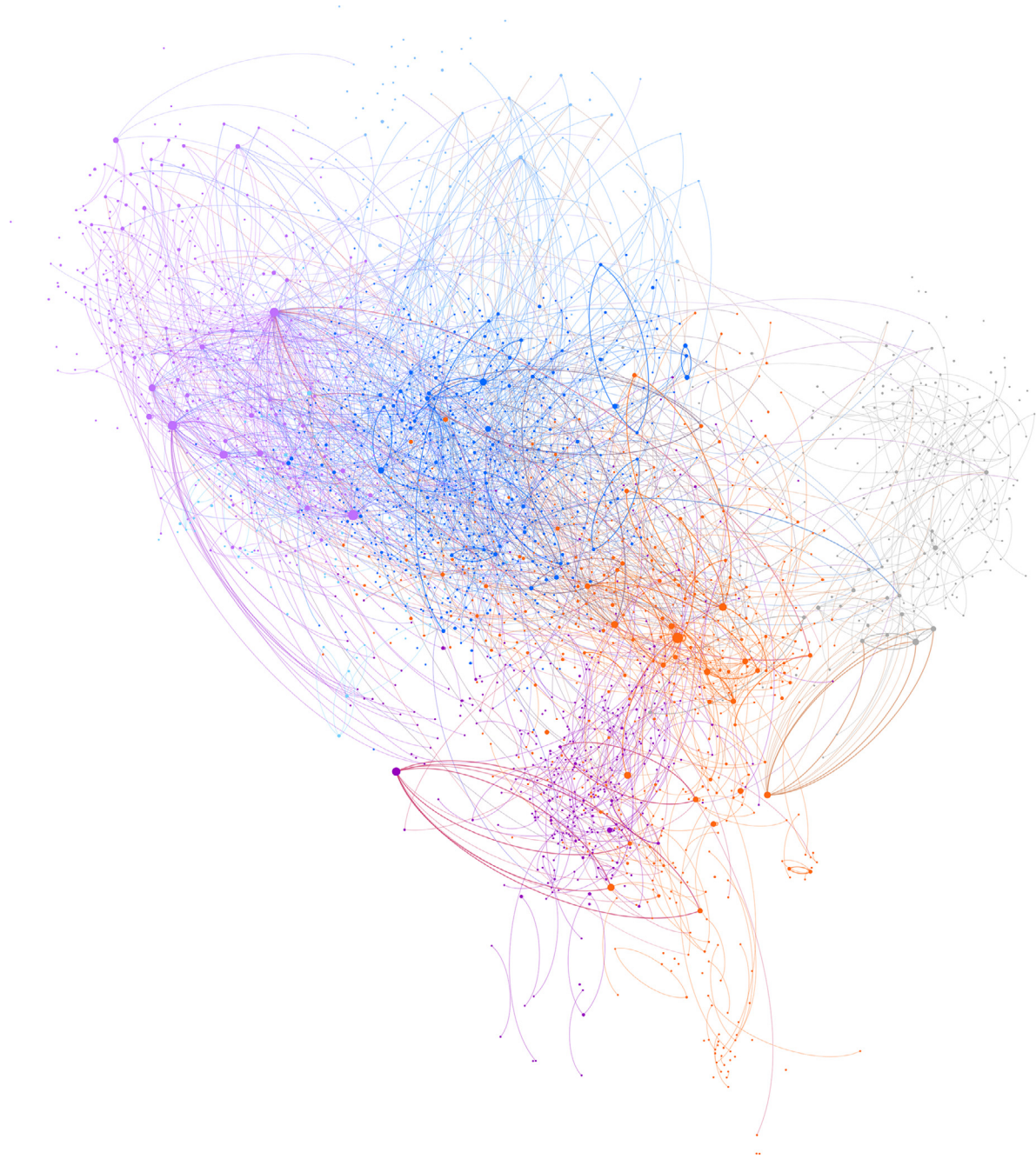
Fig. 2. The network only including authors (users actively engaging with the vaccination debate). Edges represent interactions (retweets, quotes, mentions, and replies), node sizes represent the number of tweets about vaccination, and the colors corresponds with the communities.