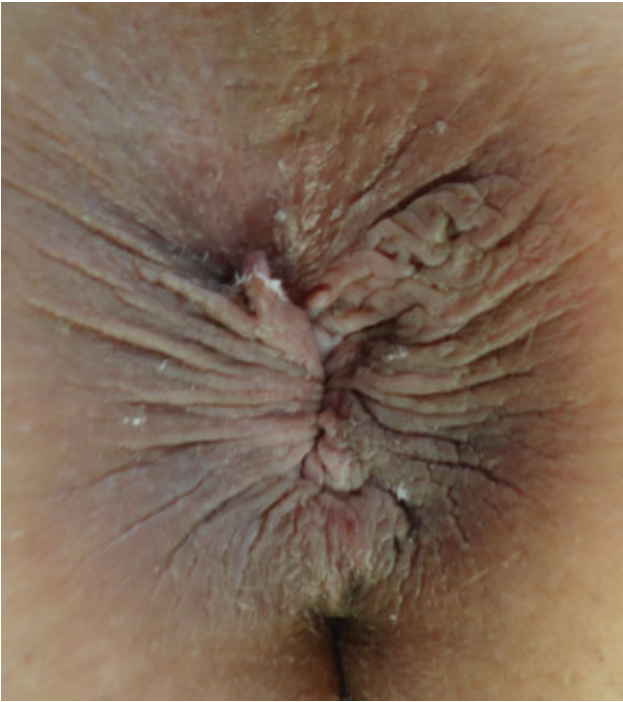
Fig. 4 Lichen simplex is the chronic presentation of pruritus ani. Thickening of the anal verge tissues and deepening of the rugal folds may be apparent as well as concentric superficial radial fissuring.

between insufficient versus aggressive or excessive practices. Documentation of alcohol, tobacco, and caffeine, and similar compounds is important. Other dietary factors should be considered including those that alter the pH of colorectal mucous or increase its delivery by flatulence.