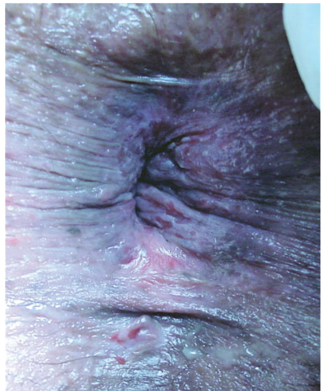
Fig. 3 Severely excoriated and macerated tissues are evident within the anal margin representative of one extreme of the itch-scratch cycle.

simplex. The tissues within the anal margin are thickened and the rugal folds are deeper and/or superficial fissuring (radial cracks) of the skin may be apparent in this setting (→ Fig. 4). Frank ulceration of the skin is more concerning and requires definitive diagnosis with biopsy and pathologic confirmation.