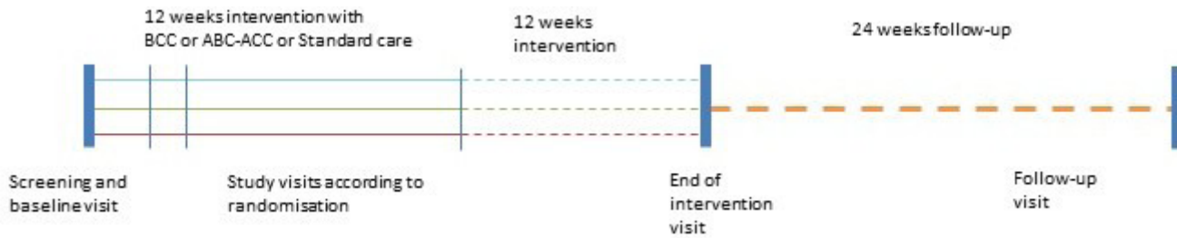
Figure 1 Study design. ABC-ACC, advanced carbohydrate counting with an automated bolus calculator; BCC, basic carbohydrate counting.

All participants will be instructed to follow their regular diabetes care in the hospital, which usually includes 4 yearly visits with a diabetologist (endocrinologist) and 1 yearly consultation with a diabetes nurse. Participants will be instructed not to receive any further dietary education during the study period. Close relatives can participate in the dietary education in all three study groups if the participant needs support to manage dietary changes.