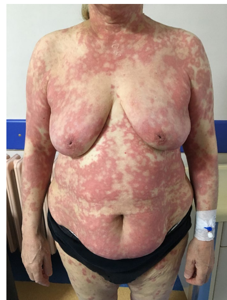
FIGURE 1 Diffuse erythematous and edematous plaques with nonfollicular pustules on her body

Severe cutaneous adverse reactions to drugs are associated with morbidity, mortality, healthcare costs, and drug development challenges. They are a wide spectrum of entities consisting of Stevens-Johnson syndrome, toxic epidermal necrolysis, drug reaction with eosinophilia and systemic symptoms syndrome, and acute generalized exanthematous pustulosis (AGEP). 1 The term of AGEP is first used in 1980 by Beylot et al in the medical literature as a separate entity. 2 It is a rare adverse drug reaction represented by suddenly onset of widespread nonfollicular sterile pustules on erythematous and edematous plaques, high fever ( >38^{\circ}\text{C} ), and neutrophilia ( >5000/\text{mL} ). The initial lesions start from the face and fold areas and rapidly dissipate. Targetoid lesions and purpura