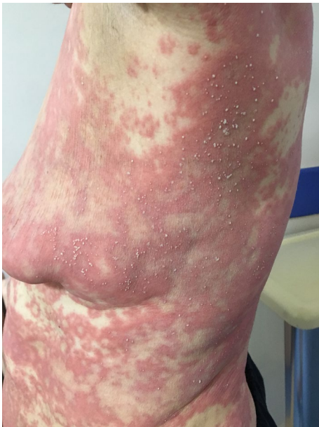
FIGURE 3 Nonfollicular pustules

can be observed in some patients. Mucosal involvement is uncommon. The reaction resolves fully in 15 days. 3 The reported mortality is 5%. 4