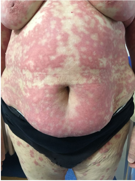
FIGURE 2 A closer screenshot of plaques