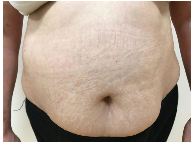
FIGURE 5 Total clearance after 22 d of cyclosporin

corticosteroids that cleared successfully after treatment with low dose of cyclosporine (CsA).