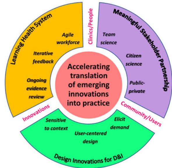
Fig. 1. (Color online) Design for Accelerated Translation (DART) framework. Forming meaningful stakeholder partnerships, designing innovations for dissemination and implementation (D&I), and engaging in a learning health system as a three-pronged approach to accelerate translation of emerging innovations in practice.

The equation may serve as a heuristic, indicating that if either the evidence of effectiveness is very weak or if demand for the innovation is very low, then movement toward implementation should come to a halt. The influence of these factors is moderated by a denominator that includes risk and cost, such that the pace of translation is relatively unaffected when the risks and costs of implementation are low yet the pace of translation is substantially reduced when risks and costs are high. One might hypothesize that an innovation with limited existing evidence of effectiveness yet high demand and low risk and cost may be a better candidate for accelerated translation than one with strong evidence yet low demand and high risk and cost. We encourage investigators to test this type of hypothesis through observation of naturally occurring implementation efforts involving innovations with