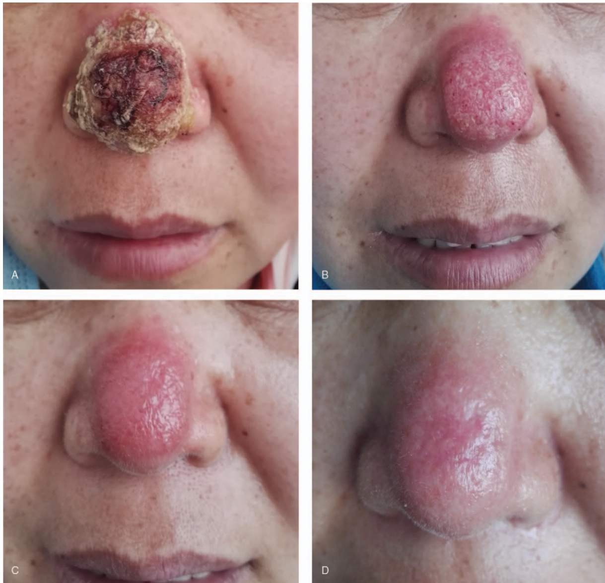
Figure 1. Manifested a plaque on the tip of the nose about 2 cm × 3 cm, which surface was covered with tawny scabs (A). Treatment by ITR for 1 month (B). Then ITR combined with TB for 1 month (C). ITR combined with TB for 3 months, clinical cure was obtained (D). ITR = Itraconazole, TB = Terbinafine.

visit. After the scratch, the blisters increased, and papules appeared, gradually forming a plaque with pustules and scabs, which forming ulcers (Fig. 1A). Basic medical institutions were treated with “penicillin” for 20 days for anti-inflammation (other drugs and doses were unknown), while ineffectively. Instead, the skin lesions progressively thickened, expanded and eroded, irregularly accompanied with itching and pain. In order to clearer diagnosis and better treatment, the patient came to outpatient in the dermatology department. She had no other history except hepatitis B. The dermatological examination revealed that there was an ulcerated plaque on the nasal tip which was 2 cm × 3 cm and covered with crusta. The ulcer surface presented cobblestone vegetans and was surrounded by a rim of erythema and pustules. (Fig. 1A). There were no papules and lumps in the face and neck, and no enlarged lymph nodes in the submandibular and neck. Due to clinical suspicion, our diagnosis is a skin bacterial or fungal infection, treatment with ITR 200 m/d was initiated. The results on