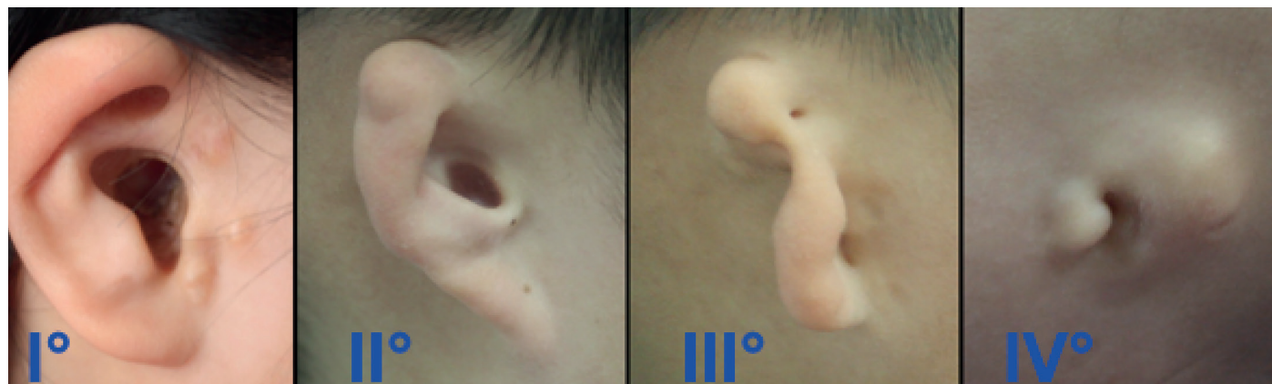
Figure 1. Classification of microtia.

The IMAW very strongly recommends bone conduction technology for children with bilateral aural atresia to support speech and language development. The decision to place a bone conduction device on a child with unilateral aural atresia is less clear and should be made by the family in conjunction with the otolaryngologist/otologist, hearing specialist/audiologist, speech therapist, and school specialists. Even though the benefits have not been definitively proven, bone conduction devices have been shown to have some benefit in