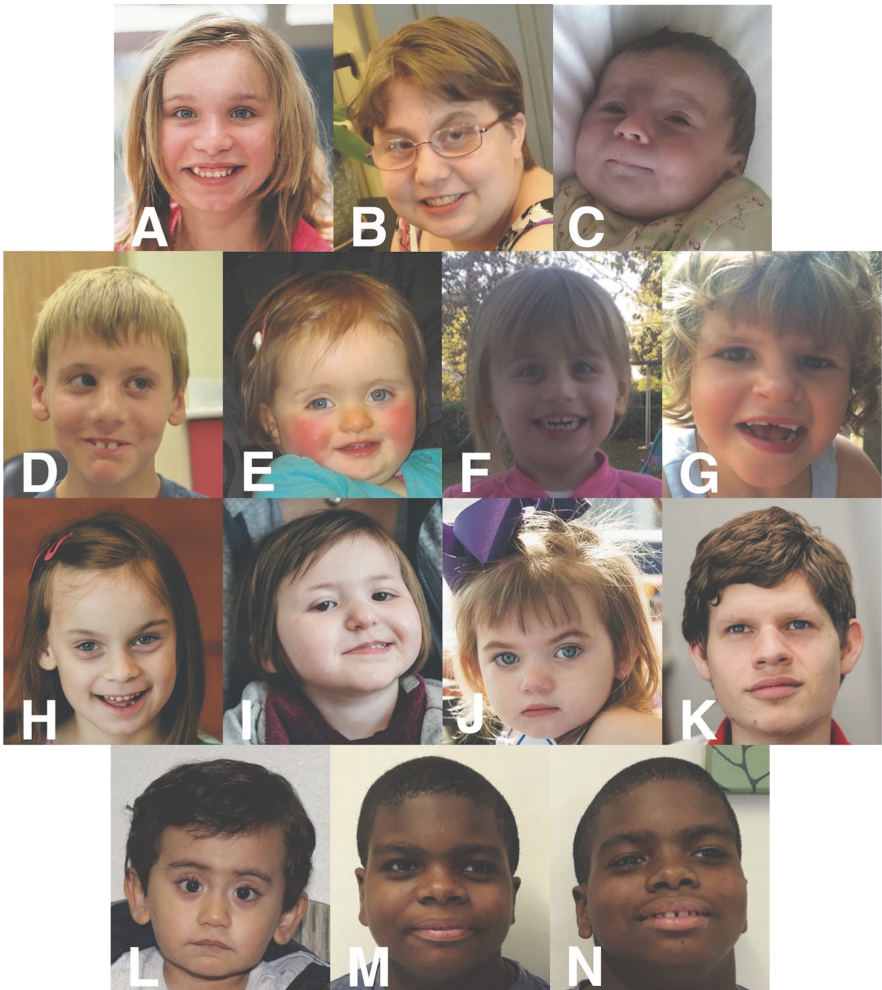
Fig. 1 Facial appearance of patients with haploinsufficiency of USP7 . While most individuals have facial dysmorphisms, including deep-set eyes and a prominent nasal septum, extending below the alae nasi, the dysmorphic features present across a varied spectrum and do not represent a recognizable dysmorphic condition at this time. (a) Patient 3. (b) Patient 7. (c) Patient 8. (d) Patient 10. (e) Patient 11. (f) Patient 13. (g) Patient 14. (h) Patient 15. (i) Patient 16. (j) Patient 17. (k) Patient 18. (l) Patient 19. (m) Patient 21. (n) Patient 22.

seven manifest characteristic facial features, and four of the eight manifest eye anomalies, namely strabismus, nystagmus, and anisocoria. Four of the eight were reported to have feeding difficulties requiring assistive techniques, with five of seven individuals having difficulty gaining weight, four of six