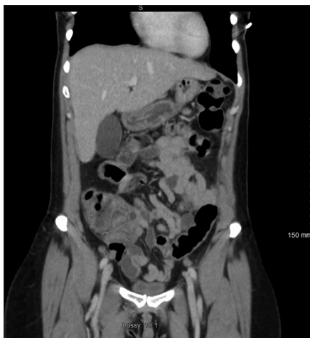
Figure 1: Axial section of CT scan of abdomen with intravenous contrast showing wall thickening of cecum with adjacent mild inflammatory stranding

The stool studies returned positive for toxigenic Clostridium difficile (CD) using real-time polymerase chain reaction (Cepheid Xpert C. difficile /Epi, Cepheid, Sunnyvale CA, USA) and was negative for epidemic strain BI/NAP1/027. The patient showed remarkable improved within 48 h of treatment with oral vancomycin with resolution of diarrhea, fever, and abdominal pain. On the third day of hospital admission, stool cultures returned positive for Salmonella sp. (Cary-Blair stool culture transport medium; Quest Diagnostics NY/NJ, USA) and was negative for Shigella , Campylobacter , and enterohemorrhagic E. coli . Her blood remained sterile. Since the patient's symptoms were resolving with the current antibiotic regime and absence of any other systemic complaints, decision was made to treat CDI with 10 days of oral vancomycin and no additional treatment for Salmonella in stools. At her 2 weeks of follow-up, the patient was asymptomatic with no further episodes of abdominal pain, diarrhea, or fever. She had no untoward effects from the oral antibiotics therapy.