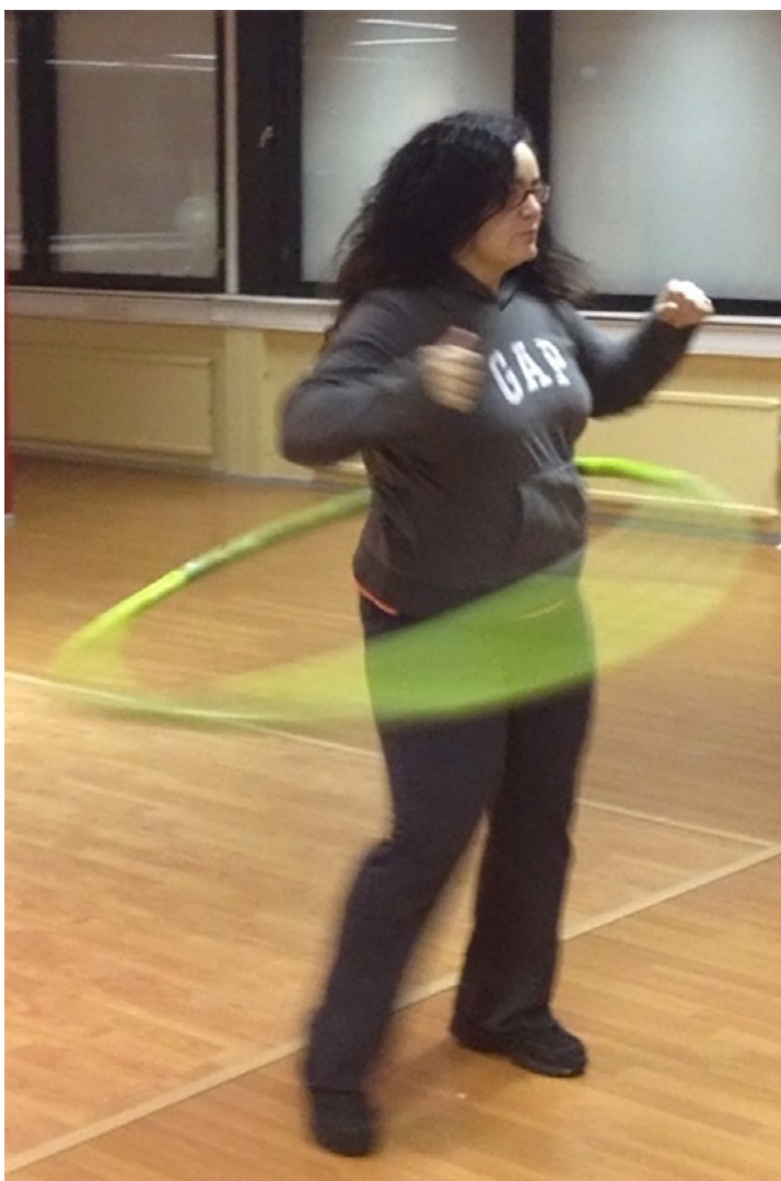
Fig. 2. A study subject hula-hooping using a 1.5-kg weighted hula-hoop (published with permission of the subject).

Cross-Over of Exercise Intervention. After visits 5 and 6, the study subjects crossed over to hula-hooping for those walking initially and vice versa. A hula-hooping training session was held for those commencing HULA after WALK.