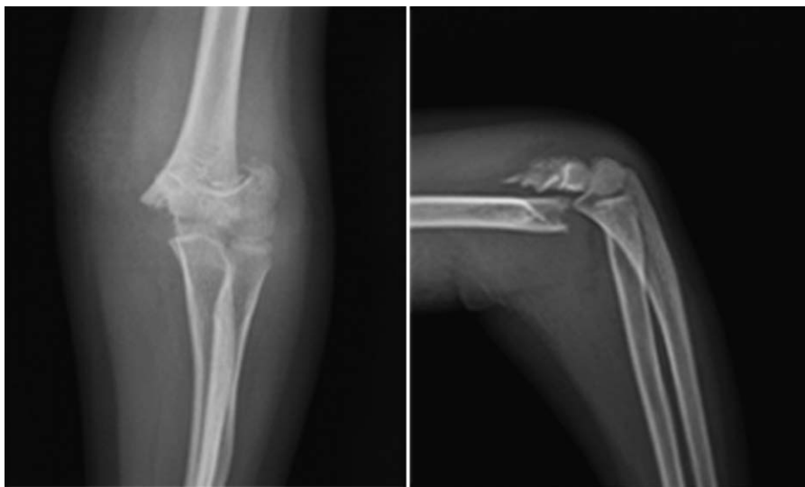
Anteroposterior and lateral radiographic views showing a Gartland type III supracondylar fracture of the humerus in a 10-year-old girl.