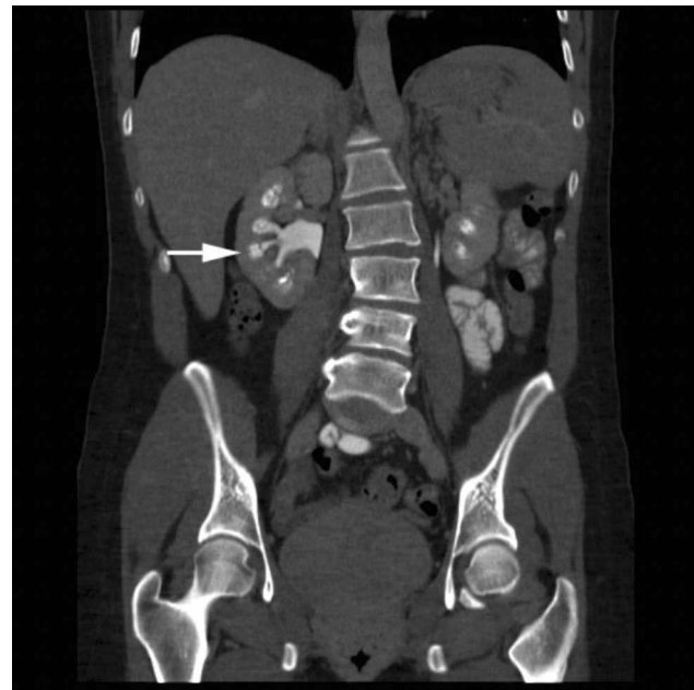
Figure 2 Computerized tomography urogram (post-contrast) coronal view demonstrating dilated medullary contrast-filled tubules and medullary calcifications (arrow).

Note: Reprinted from Perm J. 18(2), Imam TH, Taur AS, Patail H, image diagnosis: medullary sponge kidney. e130-e131, doi:10.7812/TPP/13-145, copyright(2014), with permission from The Permanente Press. Available from: www.thepermanentejournal.org . 7