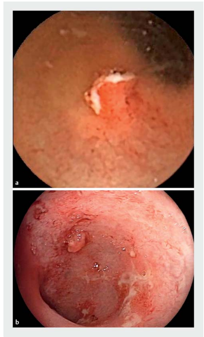
► Fig. 3 Images of ulcerative polyp in the rectum as detected with SBC-CE (a) and colonoscopy (b).

quires biopsies of endoscopically healed mucosa for histologic evaluation. The clinical importance of histologic mucosal healing has yet to be defined [29].