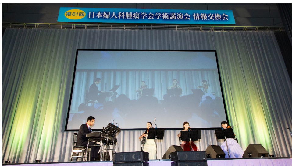
Fig. 3. Mini-concert before the Banquet of the 61th Annual Meeting of the Japanese Society for Gynecologic Oncology.

After the mid-day JSGO meeting, a banquet was held in the Tokki Messe International Convention Center ( Fig. 3 ). About 1,000 attendees gathered for the dinner, which deepened the chances for exchanges with each other, and they shared their impressions of the meeting.