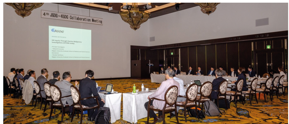
Fig. 5. Japanese Gynecologic Oncology Group/Korean Gynecologic Oncology Group Collaborative Meeting at the Spa Resort Hotel in Kahou, Japan.

held in Incheon, Korea, as part of the 6th Biennial Meeting of Asian Society of Gynecologic Oncology, during October of 2019.