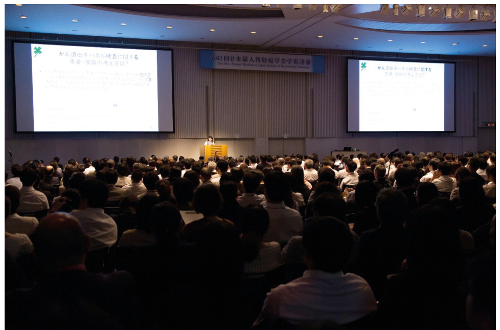
Fig. 2. The main venue for the 61th Annual Meeting of the Japanese Society for Gynecologic Oncology.

Three special lectures were also held. The first special speaker, Prof. Nicoletta Colombo, gave a clear exposition of the SOLO1 trial [1]. In SOLO1, patients with advanced-stage BRCA -mutated ovarian cancer—with a complete or partial response to platinum-based