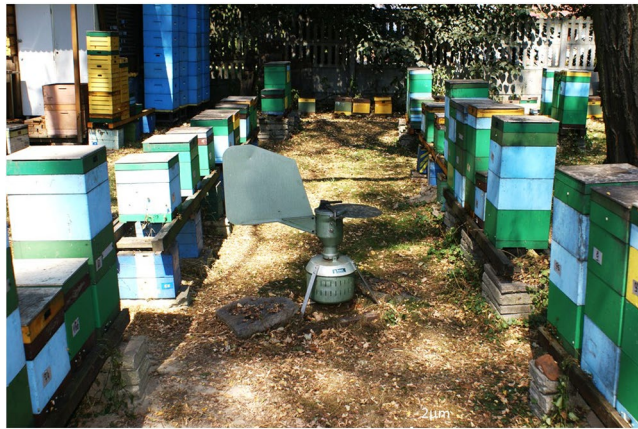
Figure 3. Experimental procedures. A Hirst-type spore trap was placed among the hives.

was insufficient to lift the spores into the laboratory air. The low number of honeybees in the laboratory and the restricted space for flying in the cages limited the spread of the spores into the laboratory air; also, because the bees maintained in the cages could not fly, they did not collect pollen or excrete faeces. However, during the laboratory experiment, there were open ventilation holes in the bees' cages, through which the Nosema microsporidia may have been transported into the laboratory air. Nonetheless, we did not detect the presence of Nosema microsporidia in the laboratory air. These results provide confirmation that experiments with both infected and non-infected honeybees can be performed in one laboratory.