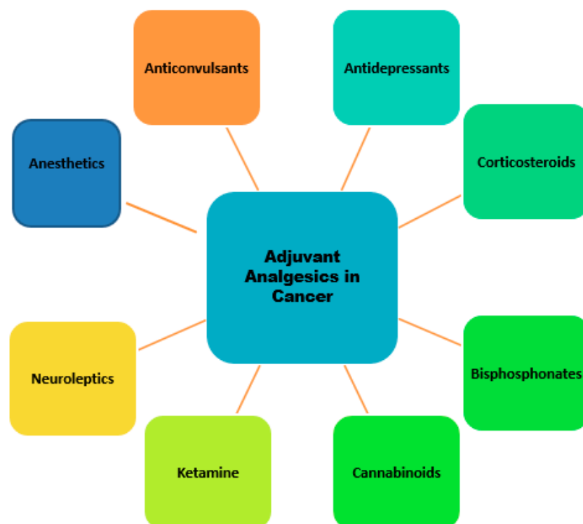
Figure 2. Schematic diagram of adjuvant analgesic drug categories for cancer pain therapy.