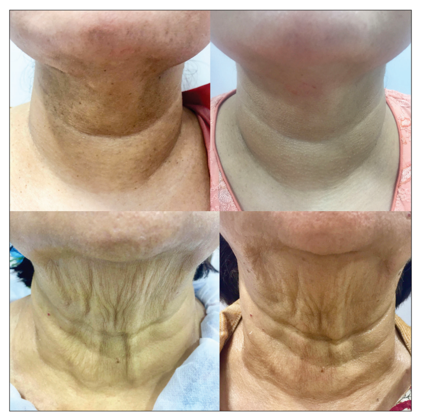
Figure 3: Pre-procedure (left) and post-procedure (right) of cases 3 (above) and 8 (below)