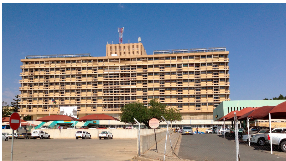
Figure 1. The Windhoek Central Hospital.

The Namibian health system has a public health service run by the Ministry of Health and Social Services (MoHSS) and a relatively well-established private health sector [3]. Windhoek, the capital city of Namibia, is the main referral centre with generally good health services. The Windhoek State Hospital, illustrated in Figure 1, is Namibia's main referral hospital. However, these services are deficient in the rural and remote populations of the country. All public pathology is managed by the Namibian Institute of Pathology—approximately 30% of the private healthcare facilities, is also managed by this institution [3].