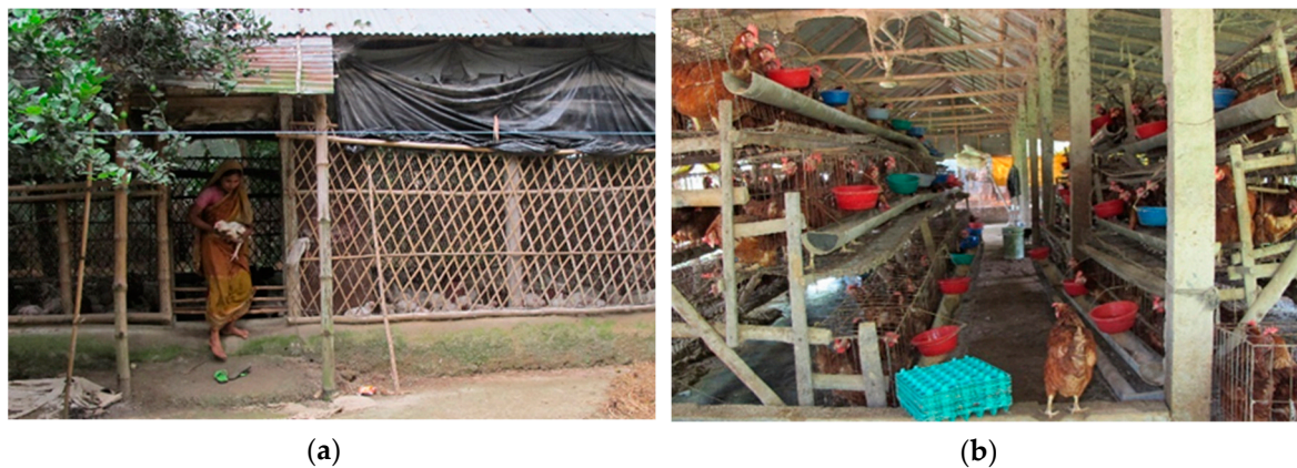
Figure 2. Commercial poultry farming: (a) a small commercial broiler farm; (b) a small commercial layer farm.

reported through the use of untreated poultry feces as fertilizer in agricultural lands or as fish feed in waterbodies [57,70].