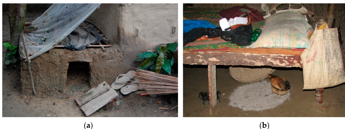
Figure 1. Backyard poultry farming: (a) backyard poultry shed; (b) backyard poultry kept under the bed.

In Bangladesh, 64% of the population live in rural villages [41], and approximately 71% of rural households raise backyard poultry (Figure 1) [42]. These backyard poultry raisers come into frequent close contact with poultry through their daily rearing practices, including putting poultry into sheds, feeding sick poultry by hand, and slaughtering sick poultry [43]. Given their limited resources and free scavenging method of raising, even the very basic biosecurity recommendations, such as controlling movement and traffic, separating sick poultry, maintaining regular cleaning, safe disposal and disinfection, are rarely feasible for backyard raisers [43–46], as observed in other similar settings [47]. Their close living arrangements with poultry put them at a heightened risk of zoonotic transmission. Several studies have identified a low awareness of AIV among the backyard poultry raisers, and biosecurity measures are seldom observed [42,48,49].