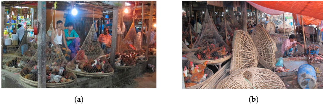
Figure 3. Live bird markets: (a) a live bird market in Dhaka; (b) slaughtering arrangements adjacent to poultry shops in a LBM.

traders [17]. Bangladeshi LBMs were characterized as having a low level of biosecurity, lack of infrastructure required to maintain biosecurity, and low awareness of transmission, prevention, and risk perceptions associated with AIV (Figure 3) [56]. Waste from these LBMs also contributed to environmental contamination [56]. Among the eight reported cases of H5N1 in Bangladesh, three were LBM workers [77,78].