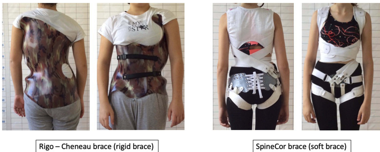
Figure 2 A rigid brace on the left side and a soft brace on the right side of the photo.

Katz et al (1997) 93 showed that Boston brace was more effective than Charleston brace in avoiding progression. Their findings were most notable for curves initially between 36° and 45°, as 83% of Charleston and 43% of Boston groups progressed. According to the authors, Charleston could be