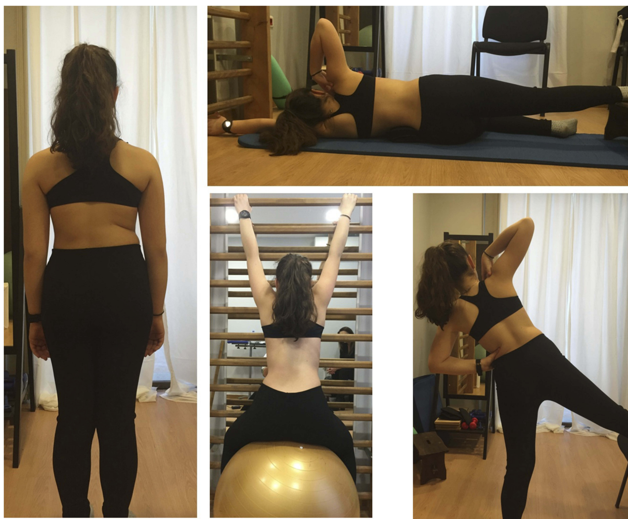
Figure 4 Physiotherapeutic scoliosis-specific exercises.

Schreiber et al (2015, 2016) 112,113 in an RCT added Schroth exercises to the standard of care (either brace or