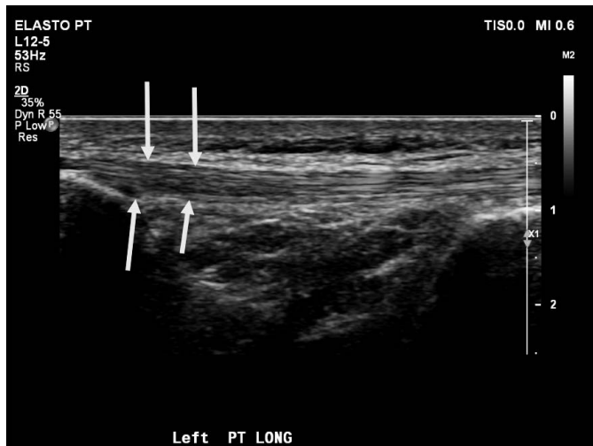
Figure 1. Diagnostic ultrasound image of a left patellar tendon (longitudinal view). Arrows illustrate hypoechoic region of the tendon.

(PTA). 5,16 An ultrasonographic image of the PTA shows a hypoechoic region (Figure 1). However, clinical findings are not always associated with PT, and PTA is not always associated with symptoms. For example, palpation of the patellar tendon alone offers little diagnostic utility. 1 Patellar tendon abnormality on an ultrasound image in the absence of other clinical findings also has limited diagnostic utility. Previous authors 7 identified PTA in asymptomatic athletes with no known history of the disease. To appreciate the health status of the patellar tendon, studies of prevalence should include measures of both PTA (via ultrasound imaging) and PT (diagnosis based on clinical signs and symptoms confirmed by ultrasound imaging).