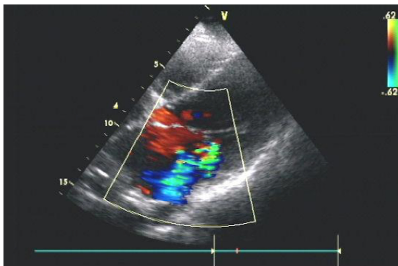
Figure 1 Echocardiography showing moderate mitral regurgitation in patient 2.

highly elevated. Particularly in patients with a long history of GD but with poor medical compliance, HHD could pose a great threat to maternal and fetal health. Second, most patients had precipitating factors, including infection, anemia, or preeclampsia. Treatment of these precipitating factors could relieve the symptoms. Prolongation of gestation for a better prognosis for the fetus is possible when the maternal cardiac burden is reduced. Considering the existing cardiac load, magnesium sulfate but not ritodrine should be applied for the prevention of preterm birth in these patients. Third, hyperthyroid heart failure responded quickly to diuretic treatment and the control of the coexistent complications. In patients with severe cardiac damage, intense monitoring of vital signs and timely treatment against acute cardiac failure attacks are still very important even after delivery.