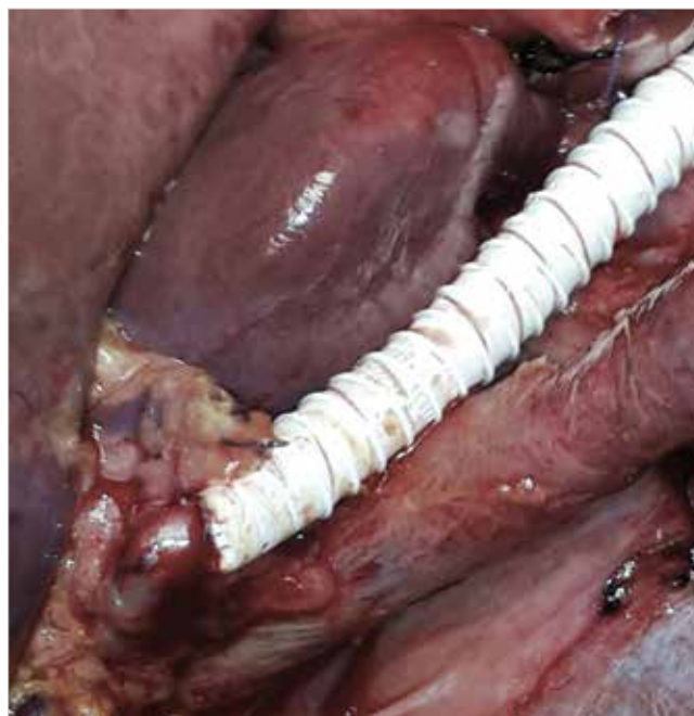
Figure 2. Complete image of intraoperative iliac-hepatic bypass.