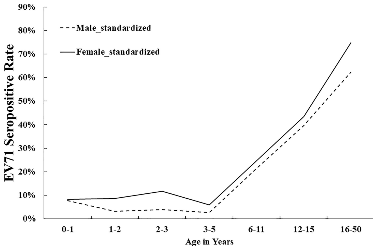
Fig 1. Age-specific EV71 serostatus between males and females in 2017. Overall, females had significantly greater seropositive rates than males ( p = 0.01 ).

significantly greater in rural areas (Hualien County and Yunlin County) than in metropolitan areas (Taipei City and Kaohsiung City). Among the four regions, there were no significant differences in the age and gender of the enrolled people, but the family size was larger ( 4.4 \pm 1.8 vs. 3.9 \pm 1.7 , p < 0.001 ) and the rate of drinking spring or well water was significantly greater (18% vs. 9%, p < 0.05 ) in rural areas than in metropolitan areas.