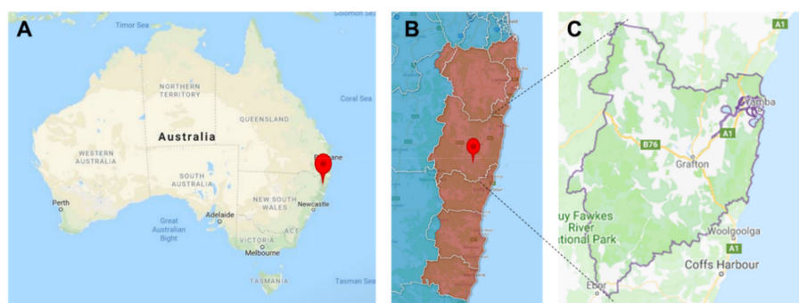
Figure 1. The Clarence Valley in the context of Australia (A, red marker); the North Coast Primary Health Network (B, red marker compared to the dark red shaded area) and the Clarence Valley Local Government Area alone (C, grey outlined area).

The Clarence Valley Local Government Area (LGA) has 51,570 residents and covers 10,441 km 2 on the northern coast of NSW in Australia (see Figure 1). The LGA is served by the Northern NSW Local Health District (LHD) who deliver secondary and tertiary care, with approximately 300,000 residents across 20,732 km 2 and the North Coast Primary Health Network (PHN), who support primary care, with approximately 520,000 residents across 32,047 km 2 [33,34].