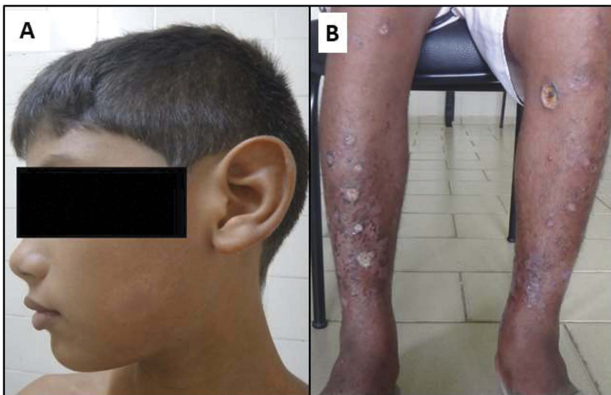
Figure 2 (A) Hypochromic macula (about 3×2 cm) with a skin-colored center located on the left side of the face (at the time of diagnosis); (B) ulcers of fibrinous aspect, with necrotic, oval areas with elevated borders alternating with desquamative areas, located on the anterior aspect of the legs. Necrotizing erythema nodosum, type II reaction during drug treatment.

in childhood is of great concern because of their effect on bone maturation and their potential to reduce growth. 38 In addition, the occurrence of many reactional episodes, especially after discharge, prolongs the time of disease and treatment, which intensifies isolation and reinforces the idea that there is no cure for the patient. 39