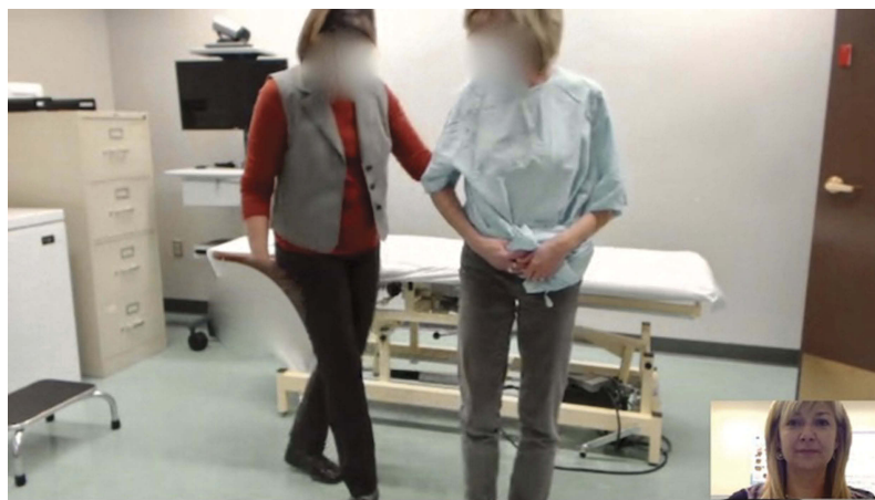
Figure 1 Physical therapist (shown in inset) view of nurse practitioner and model patient, using Vidyo secure web-based telehealth platform. 27 The physical therapist has provided written informed consent for her photo to be included in this manuscript.

The team used a laptop with VidyoDesktop Software Inc. (Vidyo Inc, Hackensack, NJ, USA). 27 An external web camera with pan, tilt, and zoom functionalities was located at the NP and patient site; this device transmitted audio and video to the consultant urban PT. Figure 1 shows the viewpoint of the urban-based PT. A full neuromusculoskeletal assessment for the lumbar spine was completed on each patient. Patients were provided with a lay summary of assessment findings, management recommendations, and education regarding expectations for treatment needs, as well as answers to any questions they had.