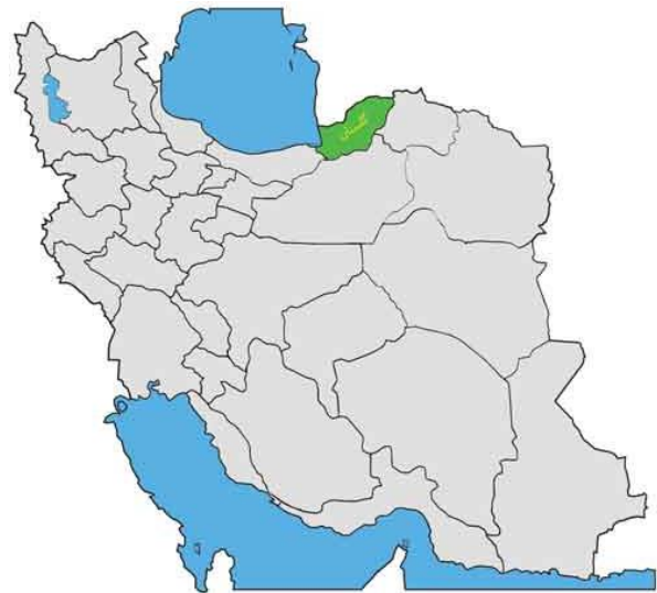
Fig. 1: Location of Golestan Province in Iran, showed in green color

This descriptive cross-sectional study was conducted from Feb to Jun 2017 in Gorgan City, capital of Golestan Province, Southeastern the Caspian Sea, north of Iran (Fig. 1).