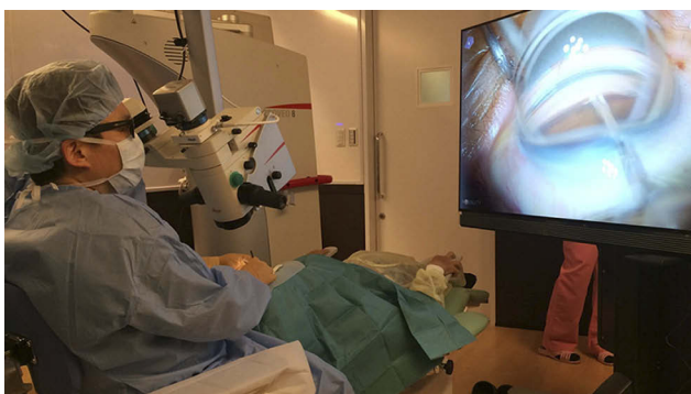
Figure 2 In HUS, the surgeon's posture is maintained even if the microscope and patient's face are tilted to acquire a good view of the anterior chamber angle when using a gonioprism.

Visualization System with VERION Image Guided System for a patient with cataract and open-angle glaucoma. The surgeon's posture is maintained during surgery.