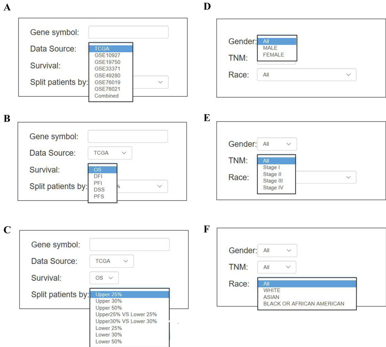
Figure 2 The screenshot of input parameter in OSacc (A–F). The options of main input parameters and clinical factors of OSacc.