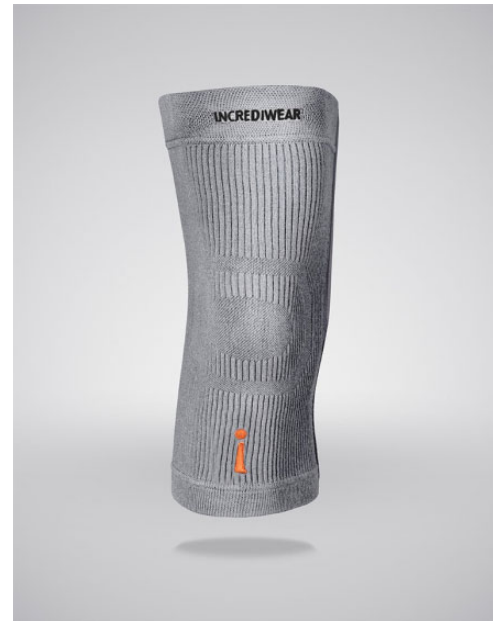
Figure 1. The Incrediwear Cred40 Knee Sleeve.

The Incrediwear Cred40 knee sleeve (Figure 1) is embedded with carbonized charcoal and germanium. Germanium is a nontoxic semiconductor metalloid located between tin and silicone in the periodic table. Since its discovery in 1886,