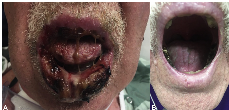
Fig 1. PNP versus malignancy-exacerbated PV. Severe erosive stomatitis of the oral mucosa before (A) and after (B) treatment with rituximab, IVIG, high-dose prednisone, and mycophenolate mofetil.