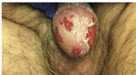
Fig 2. PNP versus malignancy-exacerbated PV. Well-demarcated erosions of the glans penis.

on rat and mouse bladder. Enzyme-linked immunosorbent assay (ELISA) revealed indeterminate Dsg1 (17 U/mL; positive >20) and elevated Dsg3 IgG antibodies (2,300 U/mL; positive >20). ELISA and immunoblotting were unable to be obtained for desmoplakin, envoplakin, or periplakin.