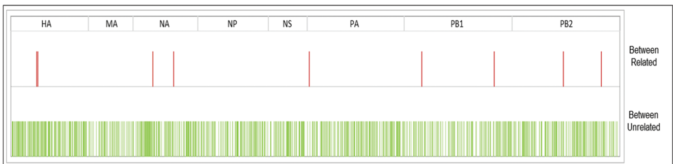
Figure 3. Variable sites highlighted across the genome between related (red) and unrelated (green) influenza A strains. The different segments and their respective boundaries are shown on top. Abbreviations: HA, haemagglutinin; MA, matrix protein; NA, neuraminidase; NP, nucleoprotein; NS, nonstructural protein; PA, PB1, PB2, polymerase protein.

The phylogenetic data for the haemato-oncology patients among whom IPC investigations had suspected cryptogenic nosocomial transmission, indicated no evidence of transmission, and this was supported by the pairwise genetic distances between them. This confirms that no breakdown in IPC had occurred in this unit. We observed a population of viruses circulating among GOSH patients (Figure 2A), which had pairwise genetic distances that were closer than those seen for any database viruses (6–11 versus > 13 SNPs; Figure 2A). Although no direct links between the patients could be found, an examination of the case histories showed that inpatient or outpatient care by the same medical team during the preceding weeks linked 8/10 of these patients. The possibility that Patient 45, for whom no link to other patients could be found, but who was a long-term GOSH patient, had had an undocumented outpatient visit remains unproven. Our data suggests transmission by unsampled, intermediate sources that led to Patients 53 and 54 becoming infected. The pattern of transmissions, occurring over a period of time, suggests that the