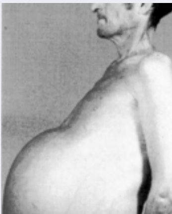
Patient with marked ascites.

Substantial evidence exists to support the concept that kidney failure in hepatorenal syndrome is not related to structural damage and is instead functional in nature. For example, almost 30 years ago, Koppel and colleagues (1969) demonstrated that kidneys transplanted from patients with hepatorenal syndrome are capable of re-